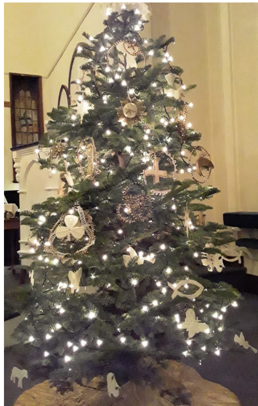
Christmas Eve celebration