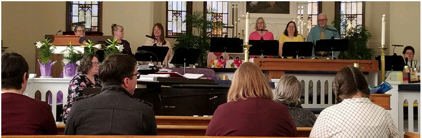
Handbells ring in the Alleluia of Easter!