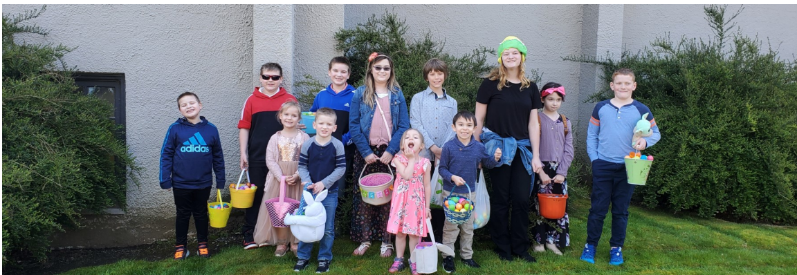
Kids at Amazing Grace having fun Easter Sunday

Prayer Chain members who hold our needs, thanks and concerns faithfully before our compassionate God.