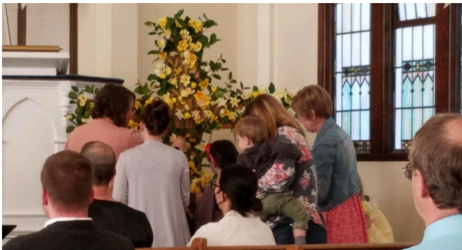
Children decorate the cross with daffodils on Easter Sunday.