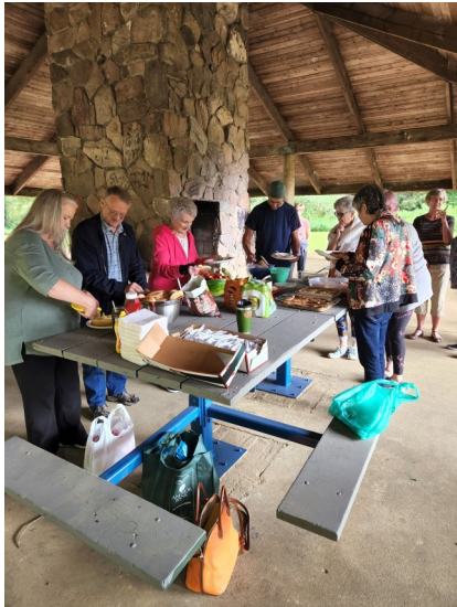
Church picnic 2022!

one is connected, and nothing stands alone. To pray for one part is really to pray for the whole, and so we do. Help us each day to stand for love, for healing, for the good, for the diverse unity of the Body of Christ and