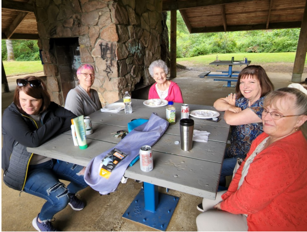
Church picnic at Steward Park was time to connect!