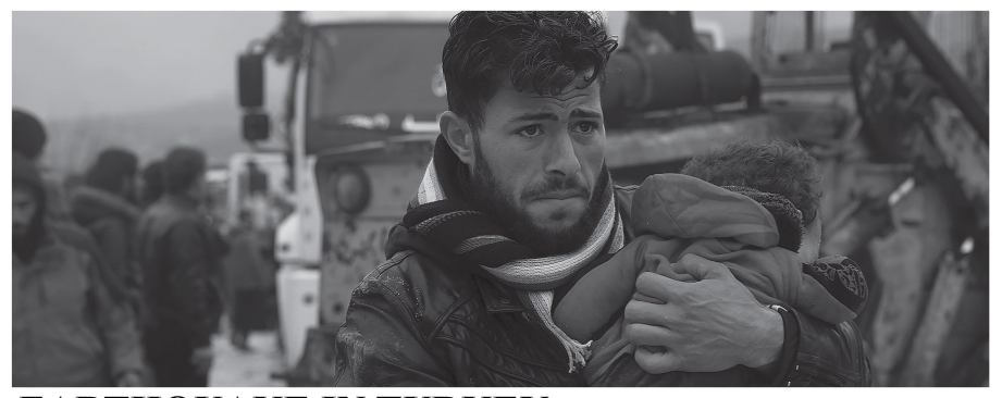
EARTHQUAKE IN TURKEY: YOUR LOVE IS NEEDED

Thank you so much for continuing to support this vulnerable group of people.