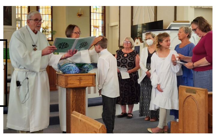
Celebration Service at 2:00 pm. In the sanctuary and displays, stained glass demonstration, Swedish and Norwegian food, video, etc. from noon until two o'clock, and after service until 4:00 or longer.

In CPR Connects by <u>anna@convergenceus.org</u> June 8, 2023 ©2020 CONVERGENCE. ALL RIGHTS RESERVED.