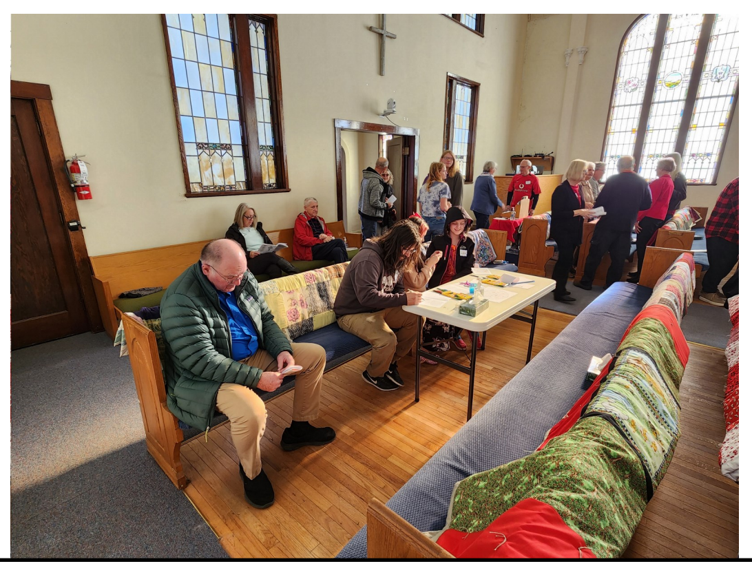
Check out the new family area in the back of the church. The families say "thank you!"