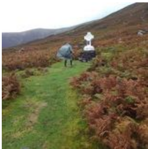
Pastor Val on Cnoc na dTdobar pilgrimage trail