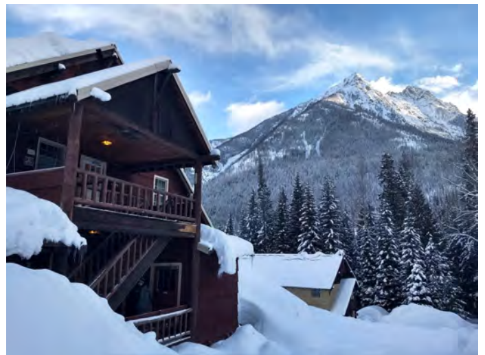
The cabin during the women's retreat.