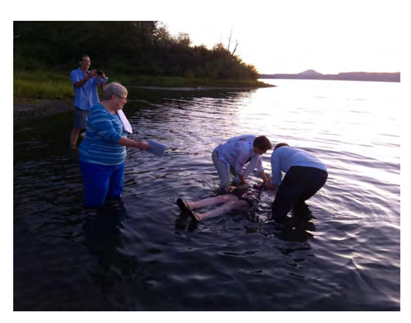
Wade in the water, children!