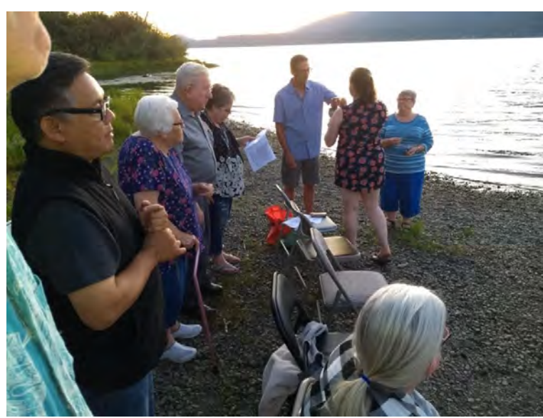
The body and blood bind us together into one—the body of Christ.