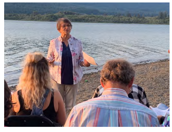
A Beautiful day for a Baptism