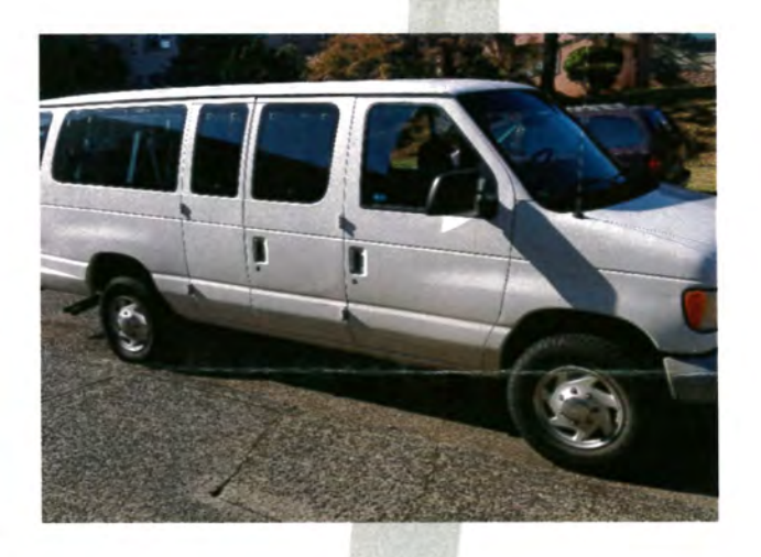
Above Right: 15 passenger van donated by Immanuel Baptist Church.