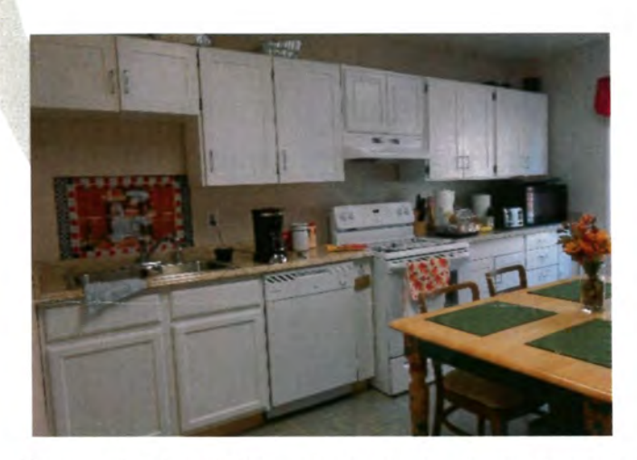
Above Left: Cabinets built by inmates at Stafford Creek. Installed by volunteers in our day center's kitchen.