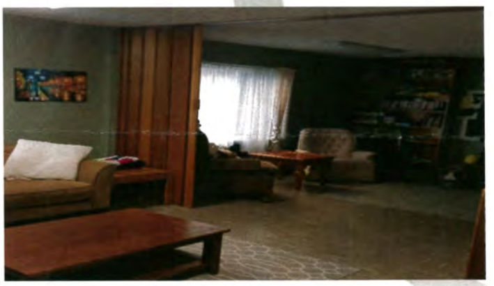
Below Right: Day room of our day center. Designed and decorated by our day center committee.