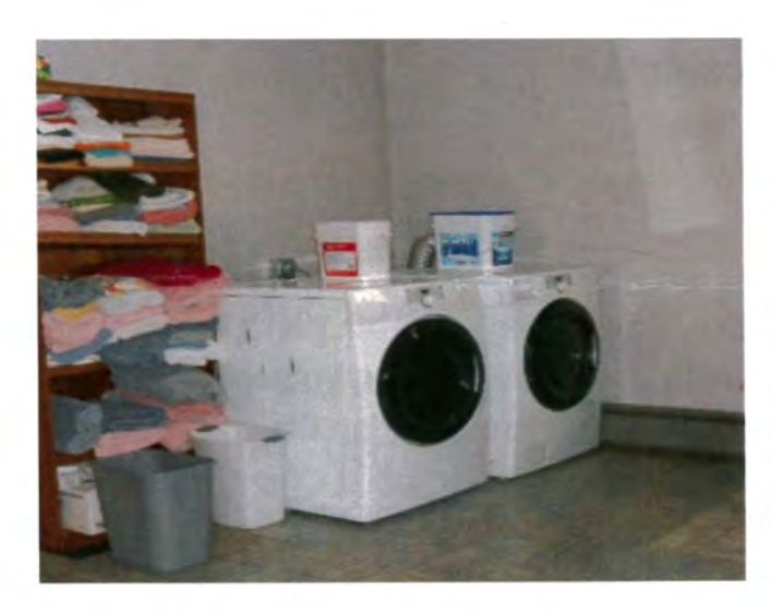
Below Left: Donated washer and dryer in our day center.